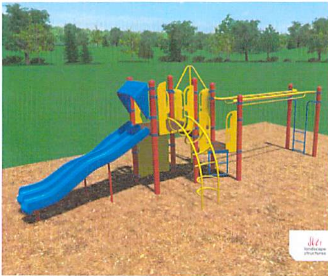
Playbooster Design 4202