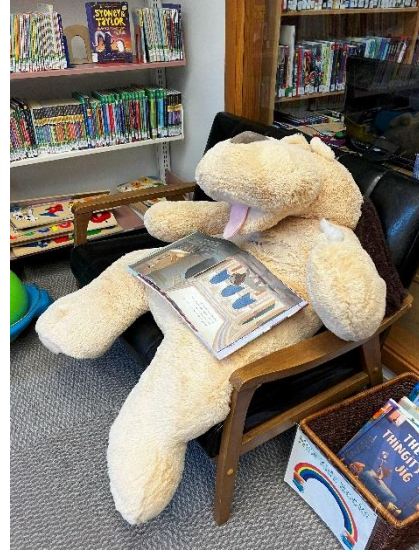
Libro, the library dog, enjoying a book!